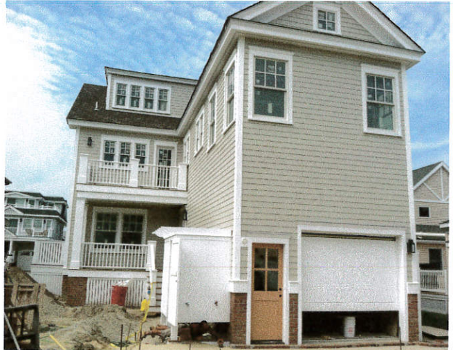
Rear View Date Taken: 08/24/2012