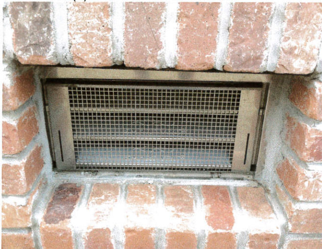
Smart Vent (7) Date Taken: 08/24/2012