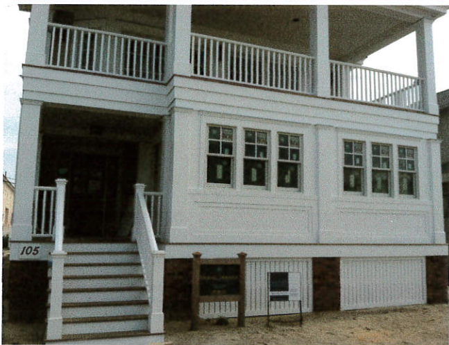
Front View Date Taken:08/24/2012